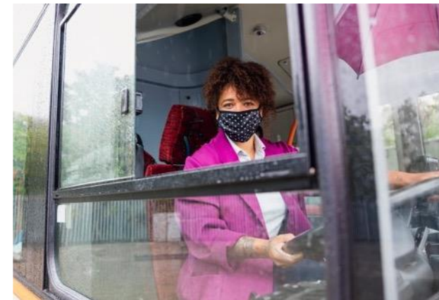
Public transport workers