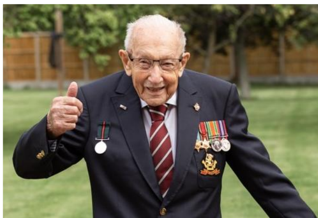
Captain Sir Tom Moore