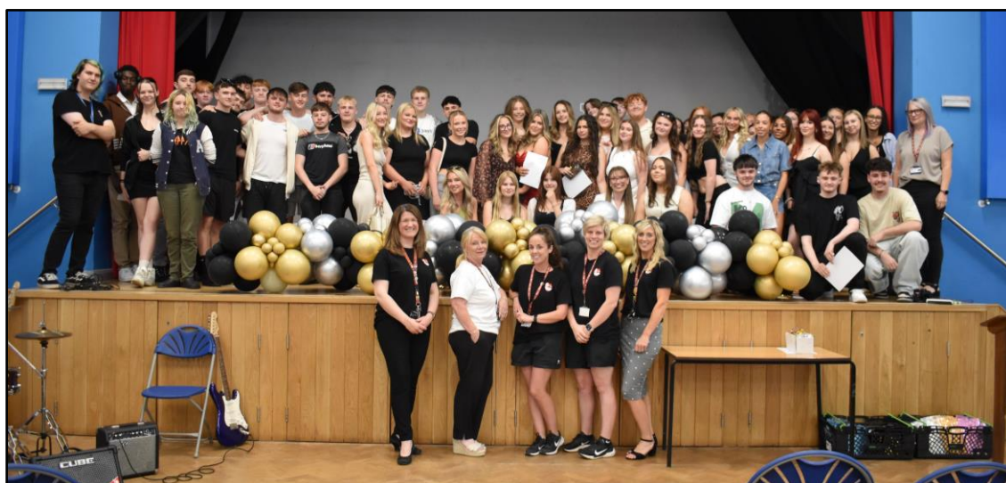
Celebrating 24 - 25 at The Coleshill School

Enrichment Activities: This year 25 different activity clubs have taken place and over 3011 Students have signed in and attended clubs this year showing a regular commitment to activities. Well Done All.